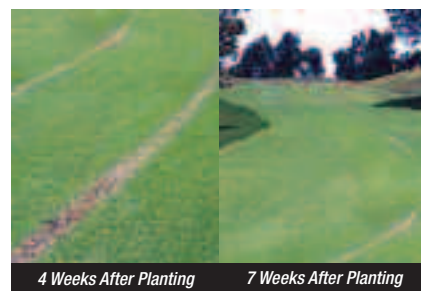
Planted On May 19th At Warrensburg, MO

"From seed to play in 49 days." That's how Riviera has been amazing grounds keepers and supervisors as far north as Indianapolis, Indiana. Your new or reseeded field can establish that fast too (with proper preparation and care practices). And you wouldn't believe how much less it costs you than sod.