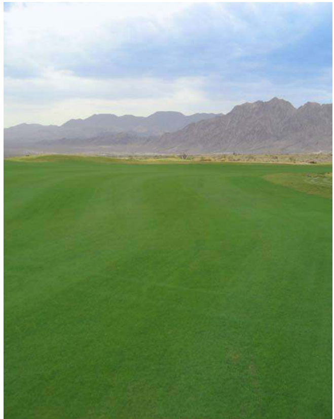
SOS 211 planted at Boulder Creek Golf Club, Boulder City, Nevada.

Boulder Creek Golf Club, Boulder City, Nevada