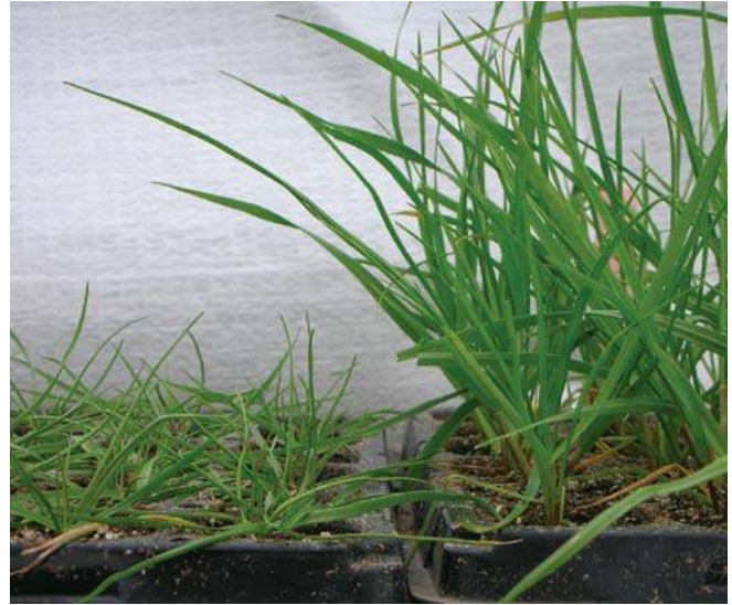
New generation turf-type annual ryegrass (left) compared to the old variety of annual Gulf (right).

This photo illustrates quite clearly what Barenbrug has achieved after years of breeding turf-type annual ryegrasses. These new varieties look like perennial ryegrass but still transition like an annual ryegrass which results in a smooth, more predictable transition. But beware of inferior overseeding options! A number of companies are promoting so-called "intermediate ryegrasses." They are, in essence, perennial ryegrasses and cannot compete with the predictable transition of annual ryegrass.