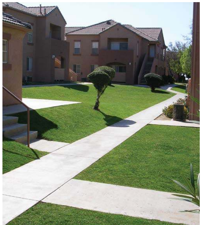
SOS 211 at Auburn Heights Apartment Complex, Bakersfield, California.

Auburn Heights Apartment Complex, Bakersfield, California