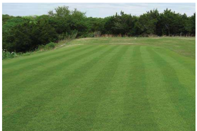
SOS at Twin Creek Country Club, Cedar Park, Texas.

Annual ryegrass traditionally lacks turf quality. It's wide leafed and is usually much lighter in color. However, it has two advantages over perennial; it establishes quickly allowing it to out-compete weeds and transitions out quickly with little help allowing for better recovery of your warm-season turf base.