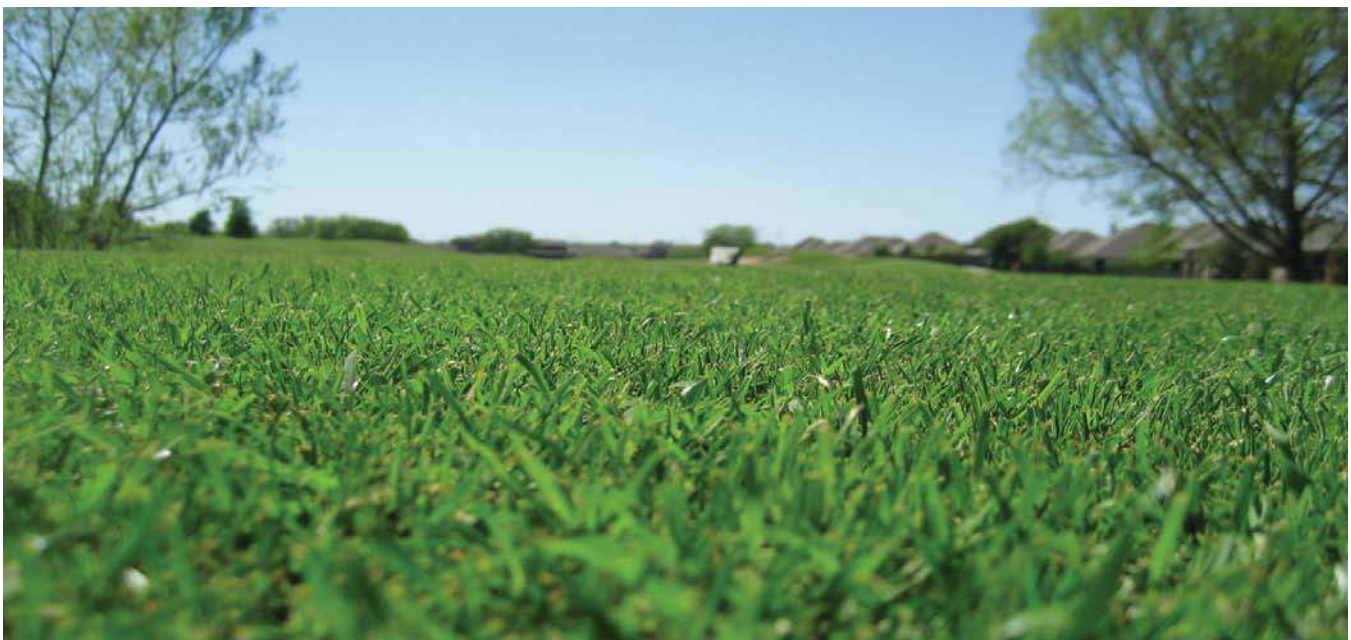
SOS planted at Whitestone Golf Club, Dallas, Texas.