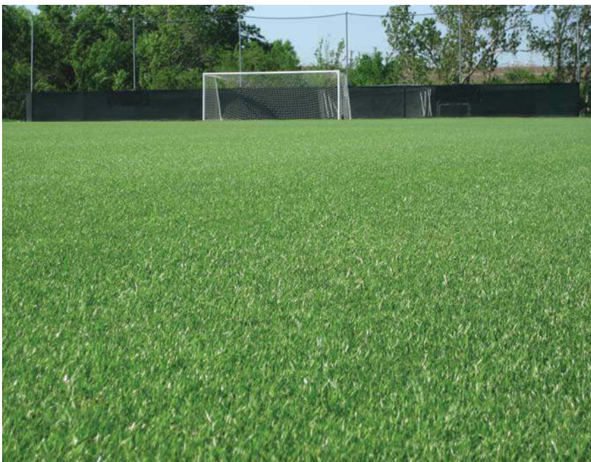
SOS planted at the Dallas Texans Soccer Club, Farmer's Branch, Texas.

Barenbrug researchers continue to develop new and improved turf-type annual ryegrasses. The varieties we use currently are Panterra and Panterra V. Panterra V is the newest turf-type annual ryegrass with excellent characteristics. With SOS you are guaranteed to get the newest and best performing turf-type annual ryegrasses on the market.